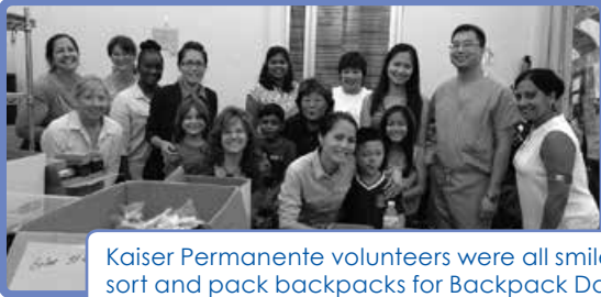
Kaiser Permanente volunteers were all smiles helping sort and pack backpacks for Backpack Day.

Thank you, Rotarians, for all your hard work on getting ready for Backpack Day.