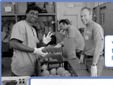
VMWare brought their team to help distribute produce on Produce Monday.