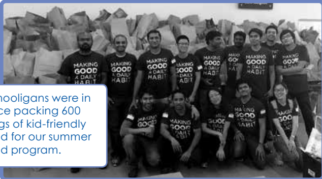
Yahoo!igans were in force packing 600 bags of kid-friendly food for our summer food program.