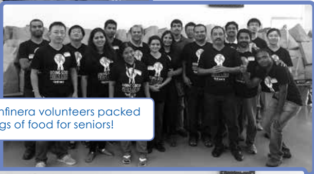
These Infinera volunteers packed 400 bags of food for seniors!