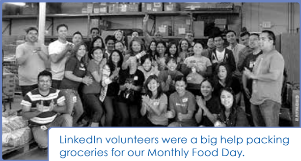
LinkedIn volunteers were a big help packing groceries for our Monthly Food Day.