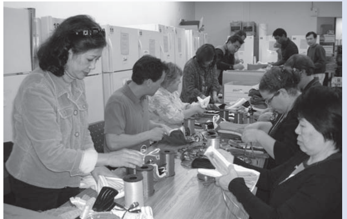
Medtronic volunteers bundled over 400 towels and kitchen utensils as gifts for our seniors.