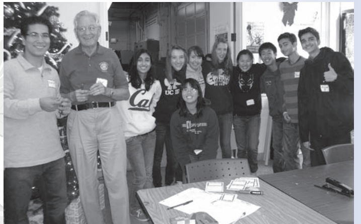
Students from Homestead High School's Interact Club and the Sunnyvale Rotary decorated the Christmas Center.