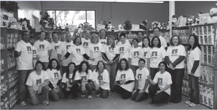
NetApp volunteers spent the morning escorting clients through the Community Christmas Center and restocking shelves.