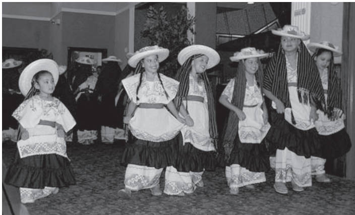
Dancers from Grupo Folklorico Los Laureles performed to everyone's delight!