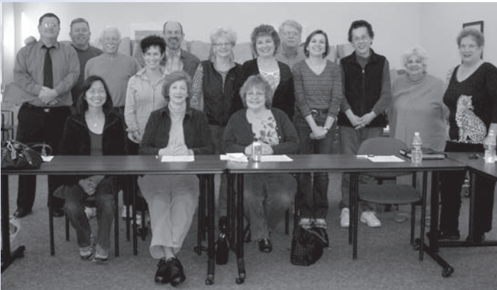
Community Christmas Center Team Leads take a short break after months of hard work prepping for the Christmas Center.