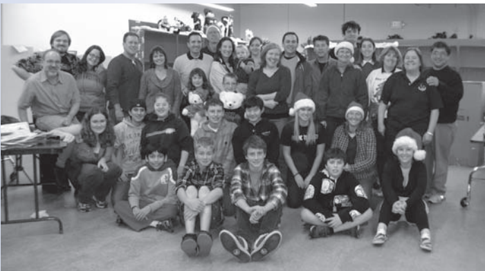
Volunteers from Scitor took down the Community Christmas Center in a record breaking 1 hour!