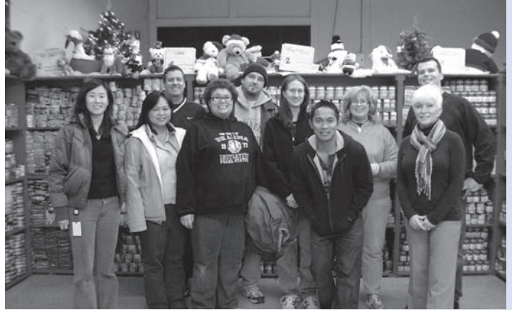
Our neighbors from Maxim helped us restock shelves and sorted canned foods.

Thanks to your support, SCS was able to give two weeks of food and holiday gifts to 1,538 families (4,687 people).