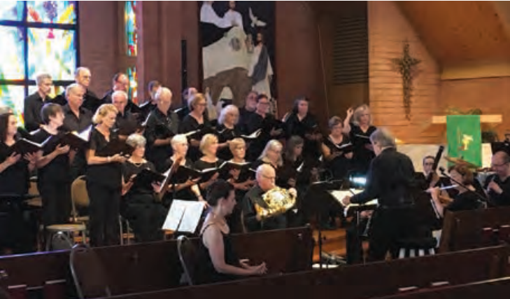
▼ Voices of Hope Humanitarian Choir