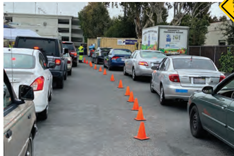
▲ Food distribution lines grow in crisis