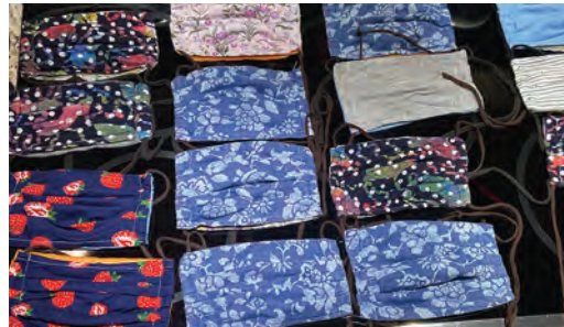
▲ Donations keep SCS employees nourished and safe ▲