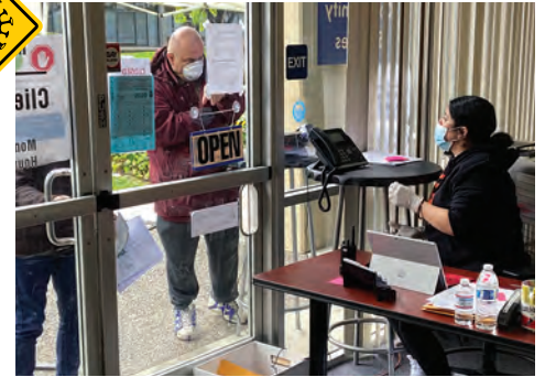
▲ Using the intercom to communicate with clients