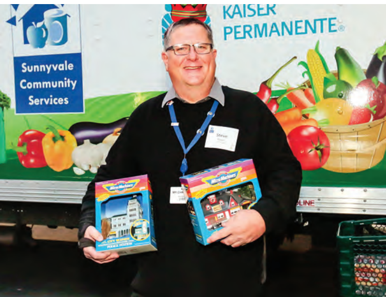
▲ SCS hopes to welcome volunteers back to our warehouse soon.

Stay tuned for more information in the coming months!