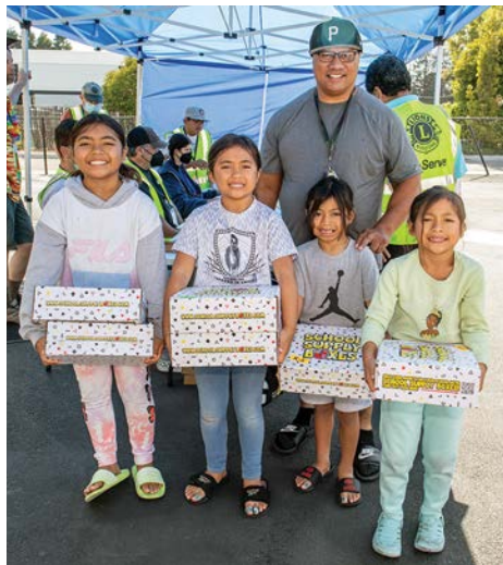
▲ This family is ready for the big day.