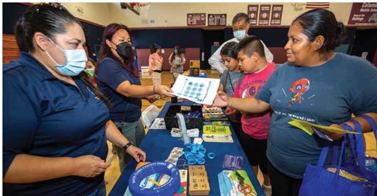
▲ A family learns about resources offered by Santa Clara County.