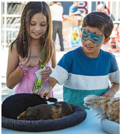
▲ Fun activities for children included a mini petting zoo, while their parents learned about resources.

In August over 200 parents and children attended the North County Student Resource Fair which was organized by Sunnyvale Community Services and sponsored by the County of Santa Clara Office of Education. While open to the public, this event was designed to reach McKinney-Vento-eligible families. The federal law called "The McKinney-Vento Homeless Assistance Act" ensures that children of homeless families have equal access to education and other services required to meet the same academic standards to which all students are held. The fair focused on providing resources in specific areas such as health, education, food, housing, finance. Agencies in attendance provided free vision screenings, medical information, food resources, affordable housing lists, and educational and financial assistance resources. ■