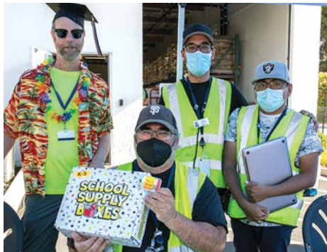
▲ Volunteers and staff ensure that clients are helped quickly and safely!