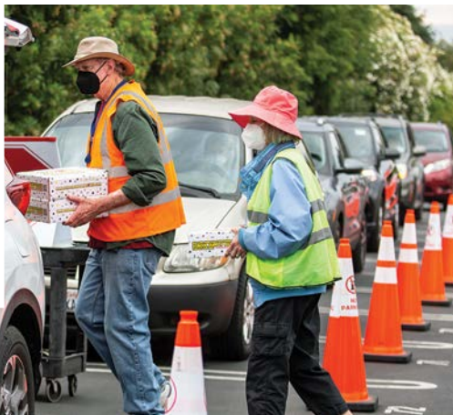
▲ Volunteers load up cars at this year's combined drive-through and walk-up format.