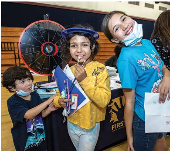
▲ Kids enjoy free giveaways including books, crayons, and Frisbees.